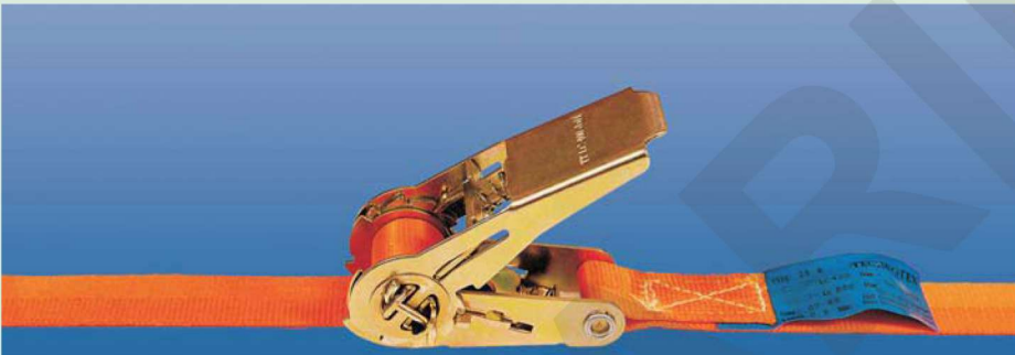
UK Lashing system 25B STF 100 daN