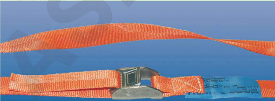
UK Lashing system IG