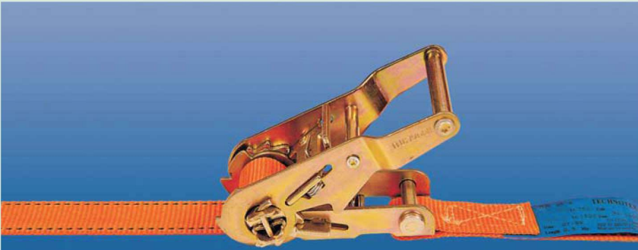
UK Lashing system 25A STF 150 daN